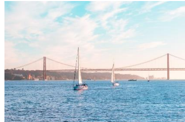
Sail in the sunset