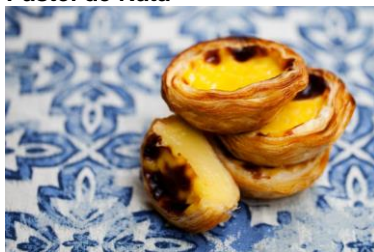
Pastel de Nata