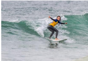
Learn to surf