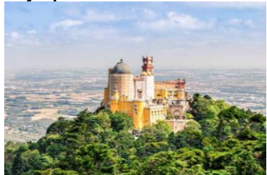
Daytrip to Sintra

Want to extend your stay in the Portuguese capital? Go on a day trip and discover what Portugal has to offer!