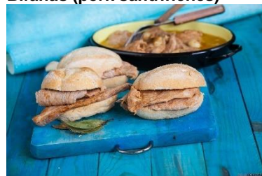
Bifanas (pork sandwiches)